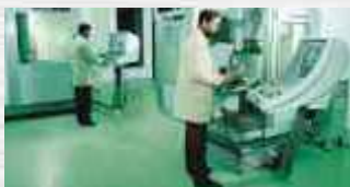
CNC Milling & Machining