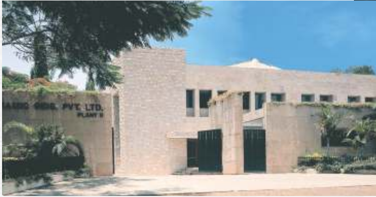
Plant - II Estd. 1992