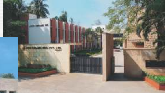
Plant-I Estd. 1970