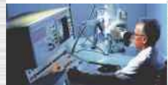
S. E. M.