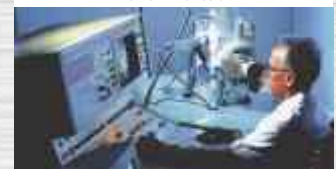
S. E. M.