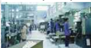
Automatic Isostatic & Uniaxial Presses