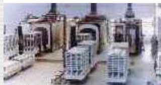
Battery of High temp. Kilns