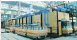
High temp. Tunnel Kiln