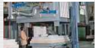
High temp. Bell type Kiln